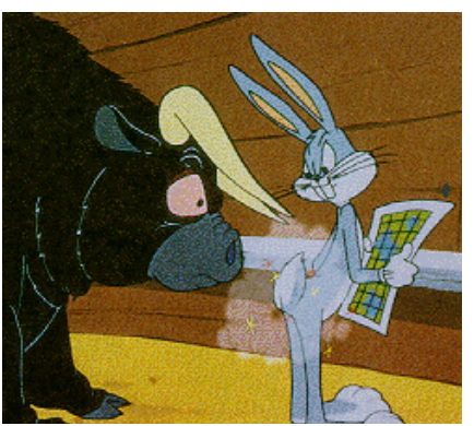
Hey, waiddaminit...'dis ain't WASHFest 2000! I KNEW I shoulda made that right toin In Albuquerque! And Stop Steamin' Up My Tail!