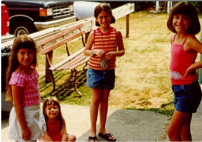
Some of the many kids and grandkids spending the afternoon with us at the WASH Picnic (sorry, we don't know who is who!)