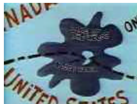
A map of Moosylvania showing its approximate location along the US/Canada border

You can also get in touch with the Moosylvania DXpedition by contacting Dr. Jay Ward at the Department of Television Cartoon Studies, School of Art, College of Arts & Humanities, Wossamotta University, Frostbite Falls, MN. For more information on Moosylvania and Frostbite Falls, see http://members.shaw.ca/fffff/faq.html .